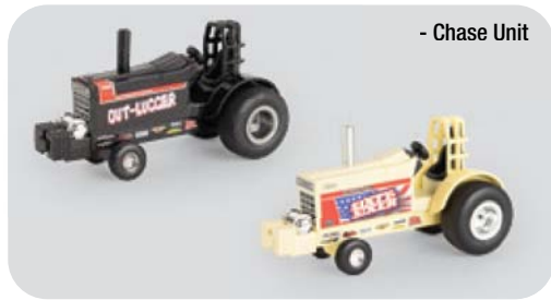
- Chase Unit