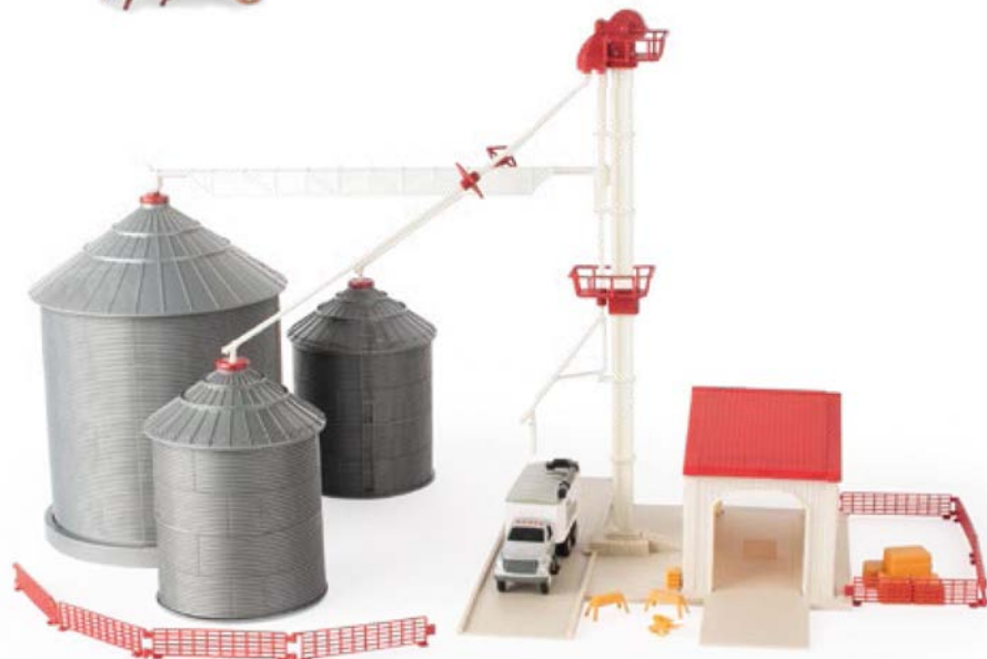
1:64 Grain Elevator Set 12924V Pack: 4 - Age grade: 5+