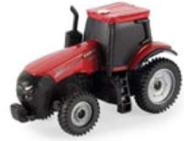
1:64 Case IH AFS Connect™ Magnum™ 380 Tractor 47166 MIN Pack: 4 - Age grade: 3+