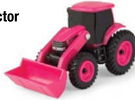
1:64 Case IH Pink Tractor with Loader 46705 Pack 8 - Age grade: 3+