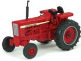
1:64 International Vintage Tractor 46573 Pack: 12 - Age grade 3+