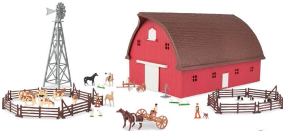
1:64 Farm Country Gable Barn 46765 Pack: 2 - Age grade: 3+