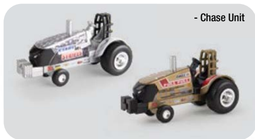
- Chase Unit

"Sixty-Sixer" puller tractor with chase unit.