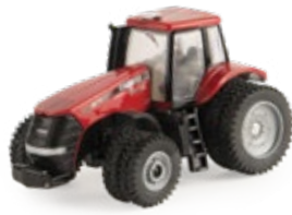
1:64 Case IH Modern Tractor 46502 Pack: 4 - Age grade: 3+