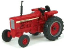
1:64 International Vintage Tractor 46573 Pack: 12 - Age grade 3+